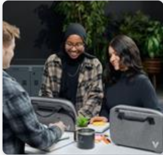
Device Support Plans