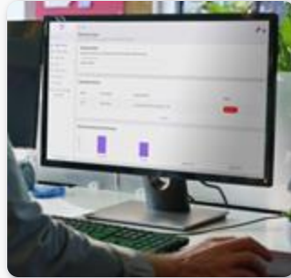
Dream™ Asset Management