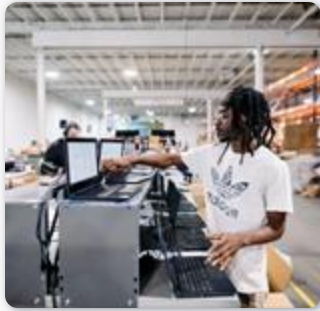
White Glove & Asset Tagging